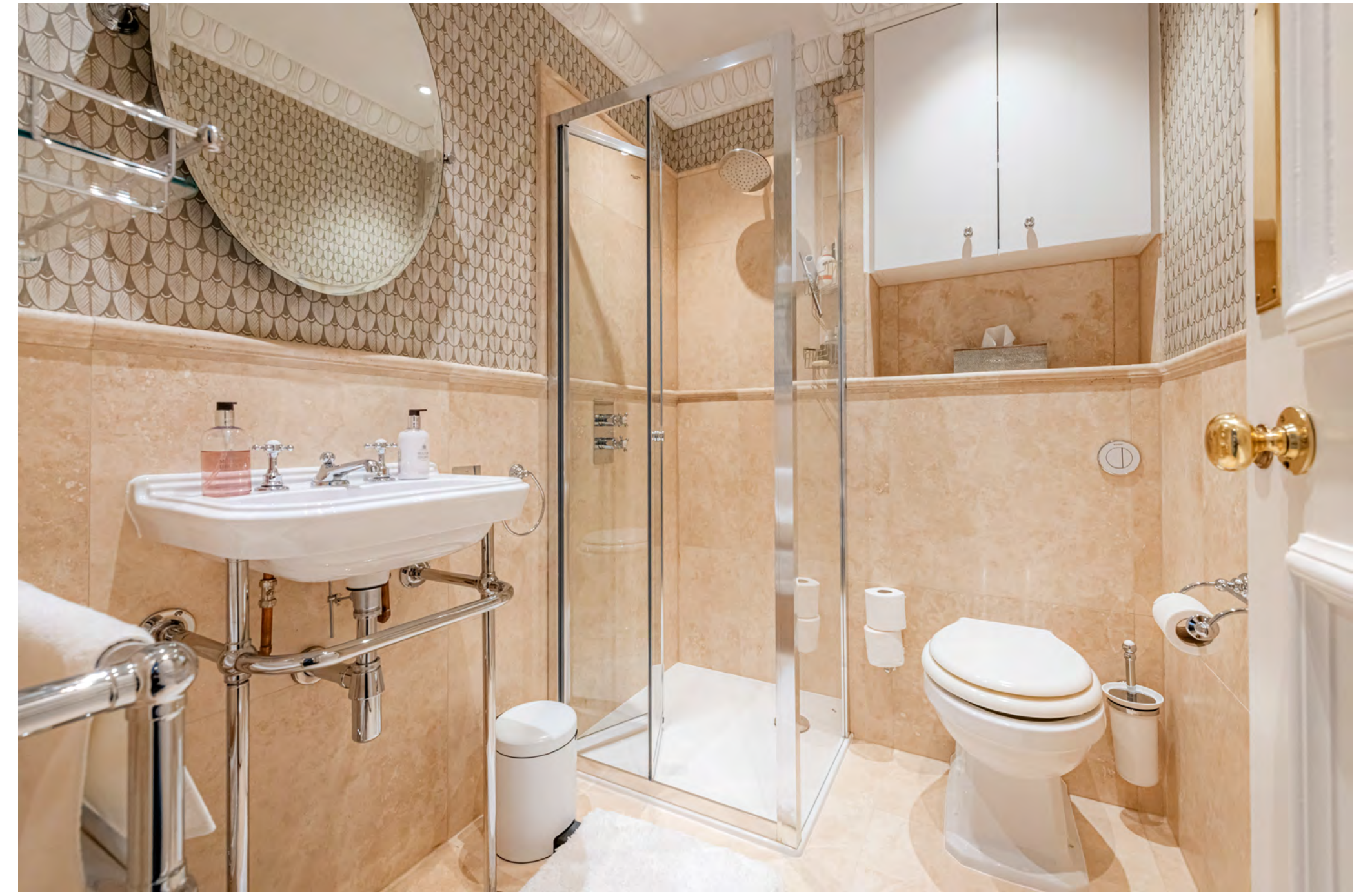
The second bedroom looks onto the rear of the building which is uniquely quiet and again benefits from storage and a large separate shower in the second bathroom.